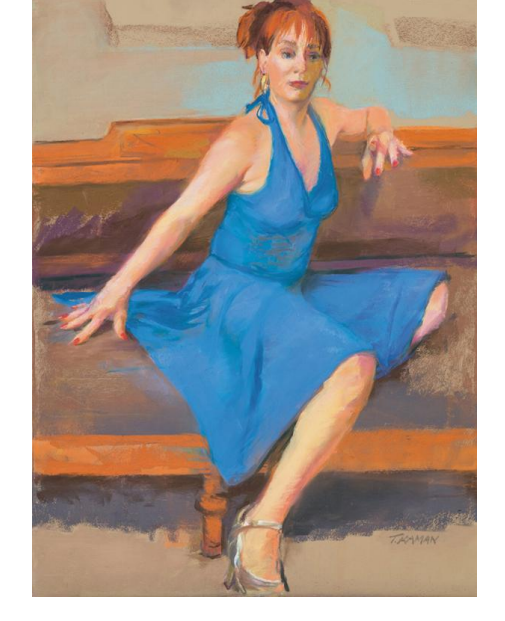
Blue Salsa Dress 20 x 16 pastel