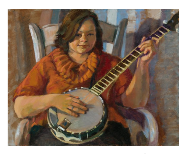
Sing a New Song 16 x 20 oil

New works created by the cover artists will also be on display. Here are my additional paintings that will be on view at Current Cleveland.