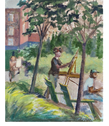
Urban Yards 18 x 14 oil