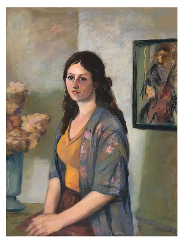
Corah 24 x 18 pastel