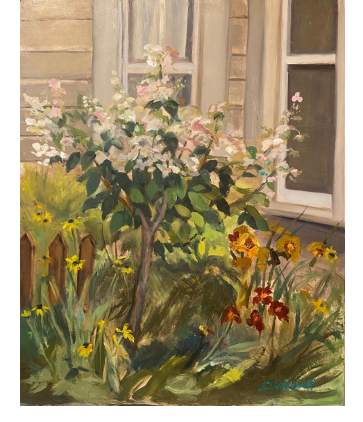
Pastor's House 20 x 16 oil Painted at Lakeside 2021