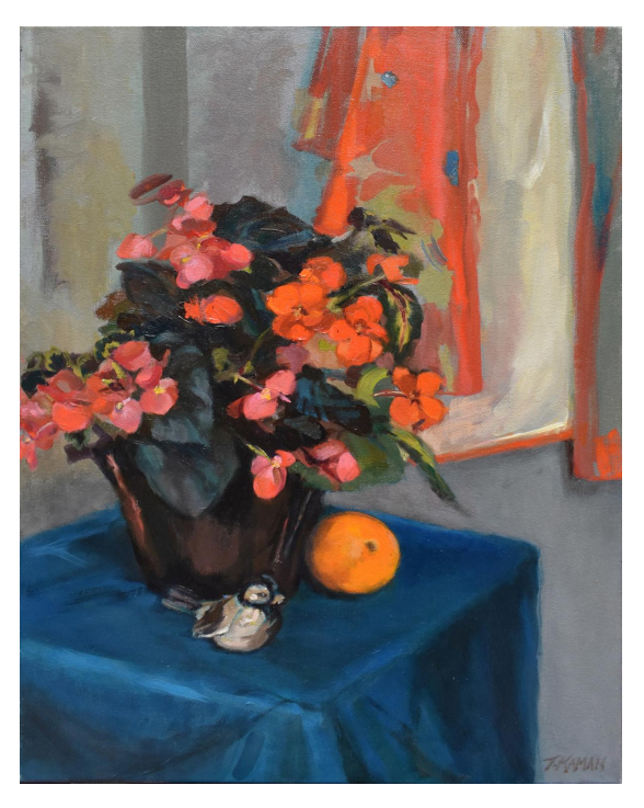
Covid Still Life 20 x 16 oil

at the Herman and Bessie Wessel Gallery 225 E 6th Street, Cincinnati OH 45202