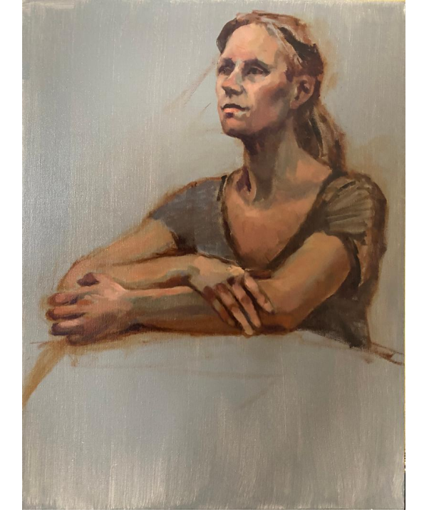
Kim Matee 20 x 16 oil