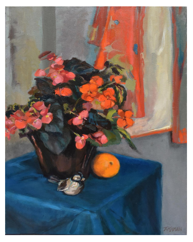
Covid Still Life 20 x 16 oil