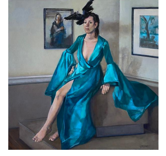
The Fascinator 36 x 36 oil