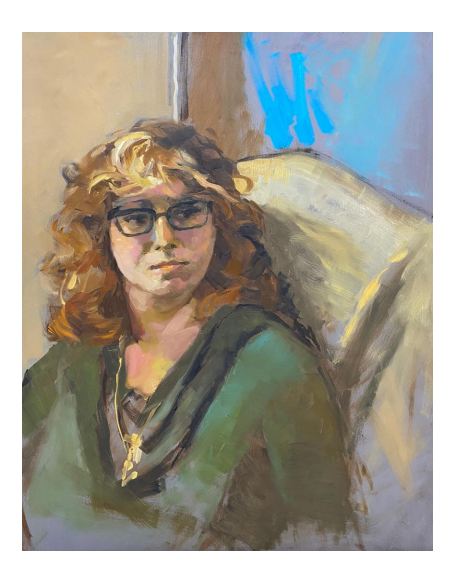
Weiland 20 x 16 oil