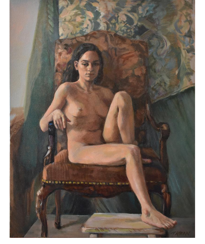
Sunday's Pose 28 x 22 oil