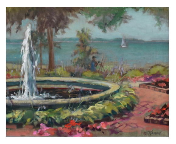
Living Waters 16 x 20 oil Painted at Lakeside 2020.

Lakeside will host more than 30 plein air artists from across the midwest. Throughout the weekend, guests are invited to watch artists paint in Lakeside. "A Wet Paint Sale" will take place on the Pavilion lawn, Sunday from 1:30-3:30pm. Plein air artists will display original paintings that were completed over the weekend, some of which will be for sale.